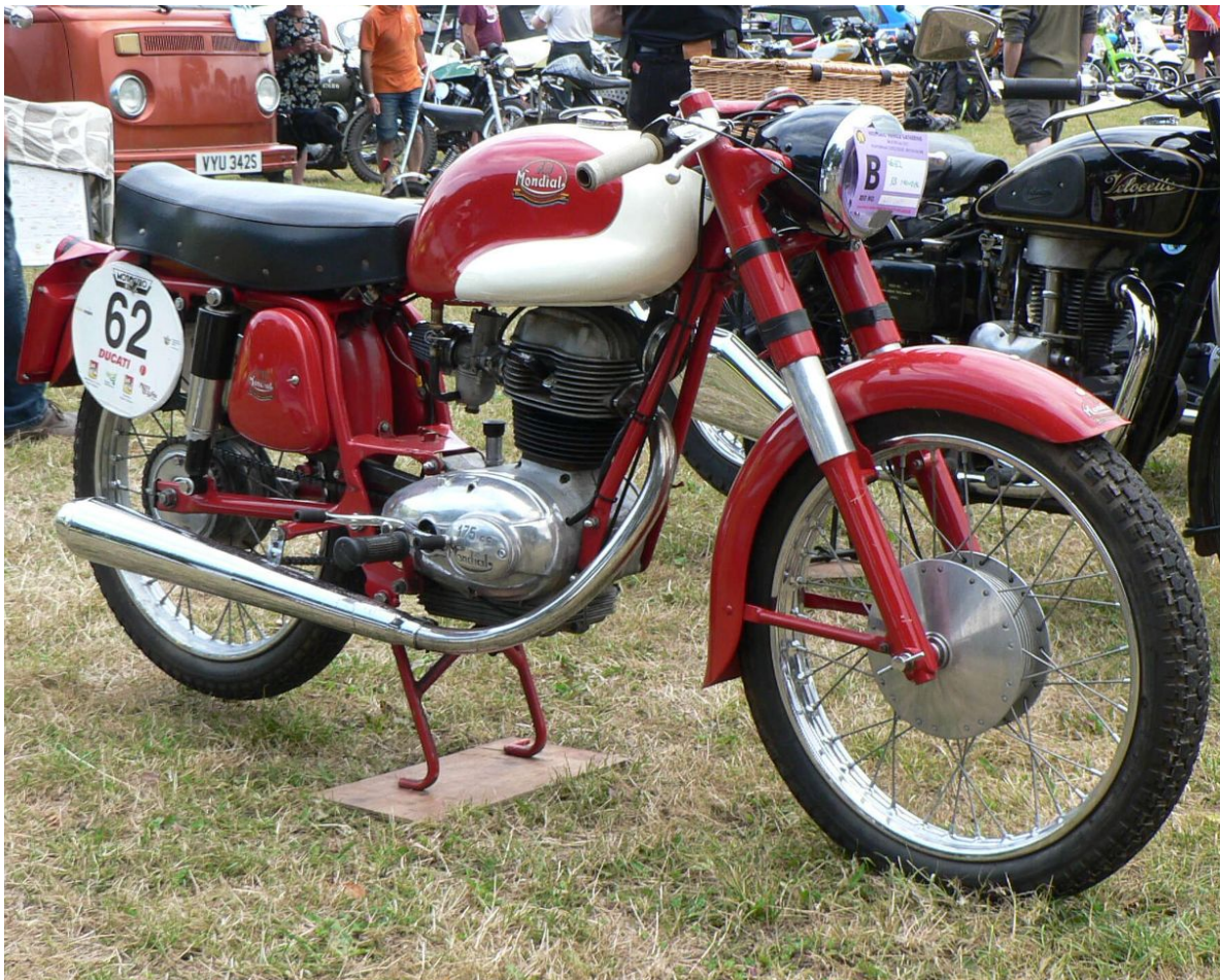
Figure 3: FB Mondial Sprint - 175cc OHV 1959

The weather was a bit patchy with probably a bit more rain than we would have liked, but we managed to squeeze under the marquee and avoided the worst of it. I had a good look around at the club stands and also photographed a few of the rarer bikes on display.