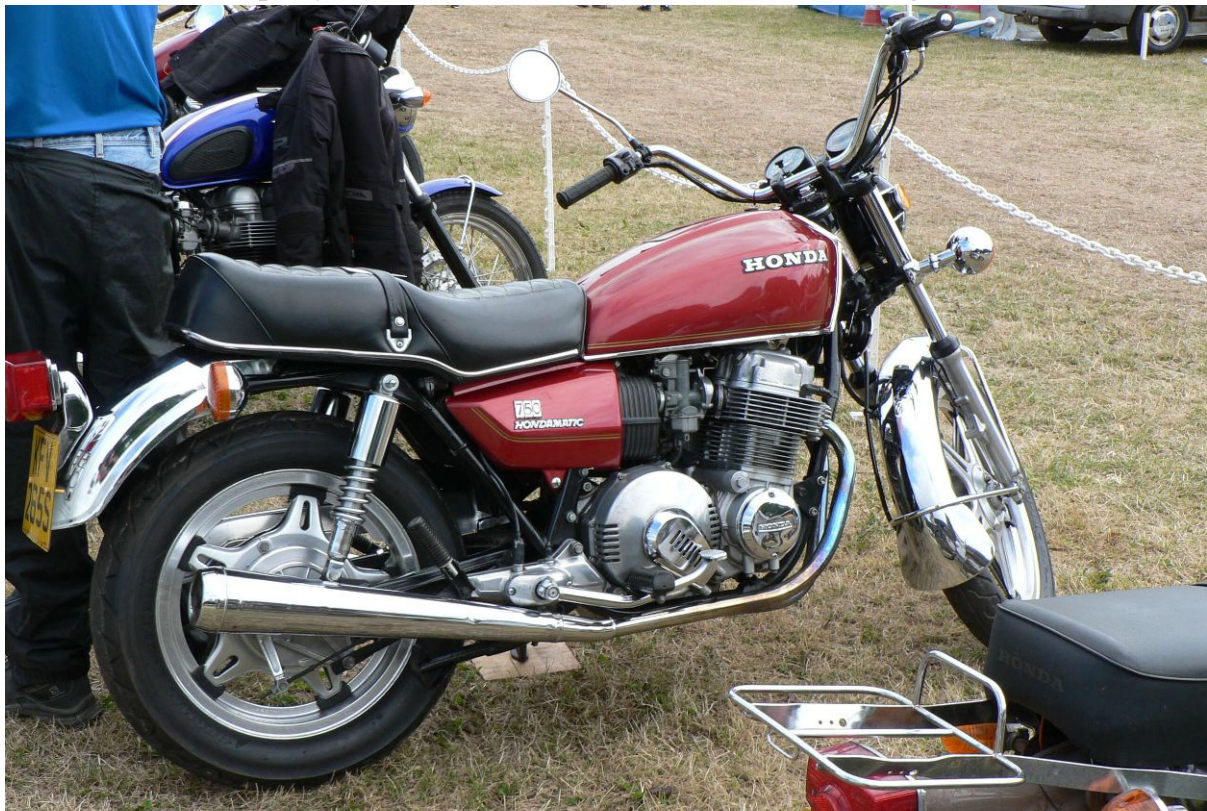
Figure 5: 1977 Honda CB750A Hondamatic.

‘Real Classic’ readers will recognise the styling as ‘snart’, from that era when ‘De Luxe’ meant an enclosed rear end. In blue and dove grey, I watched a young lad struggling to get this one started. I owned a standard one of these in the early 1970s and still have nightmares about the puny front brake which was from a much lighter Francis Barnett.