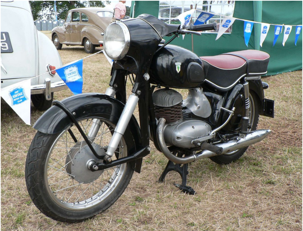
Figure 7: 1959 DKW RT200 VS 2-stroke.

Over on the BSA Bantam club stand a VIP was spotted being treated to a cuppa whilst gleaming some advice on sorting the electrics on his Bantam for his grandson to use.