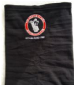
Neck Morf £8