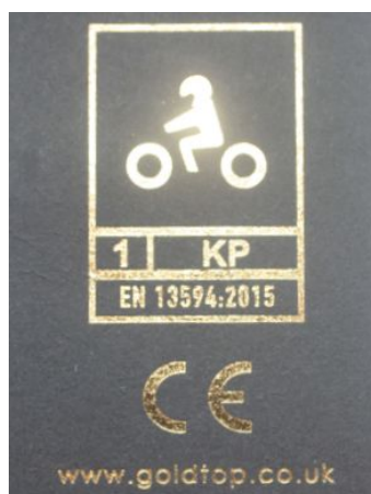
Figure 1: Approved to Level 1 of the latest standard.