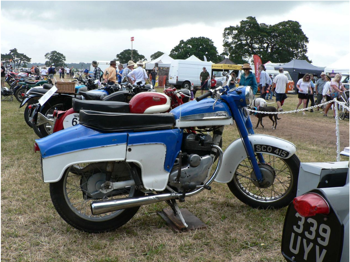
Figure 4: 1959 Norton Jubilee De Luxe 250cc twin.

‘Real Classic’ readers will recognise the styling as ‘snart’, from that era when ‘De Luxe’ meant an enclosed rear end. In blue and dove grey, I watched a young lad struggling to get this one started. I owned a standard one of these in the early 1970s and still have nightmares about the puny front brake which was from a much lighter Francis Barnett.