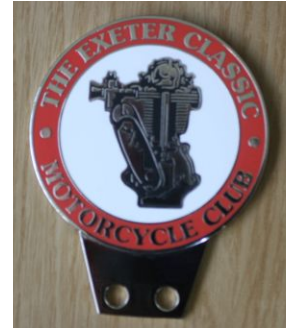
Machine Badge £15 (70mm)