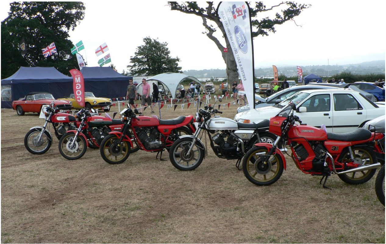
Figure 8: A good range of Morinis (350s and the odd 250) on the Morini Club Stand. Overall a good day which included a passing appearance by the A4 Pacific 60007 ‘Sir Nigel Gresley’. A fantastic sight and sound and just the 2450 drawbar horsepower. Here’s the club posse waiting to leave site after a short delay due to a medical emergency.