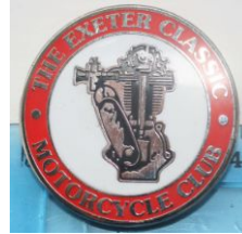
Lapel Badge £5.50 (40mm)