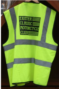
Hi Vis Waistcoat £5

Pete White holds small stocks of club regalia. If you require any items please telephone or email him (see the back page of the magazine for contact details). Payment by cash or BACS.