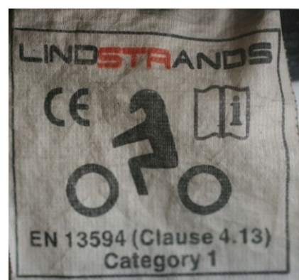
Figure 2: Approved to the earlier version of the standard.