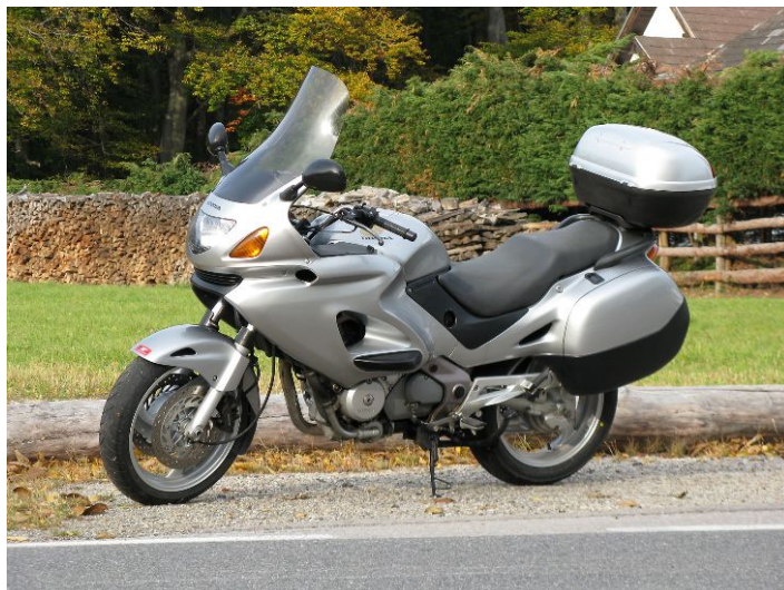
Figure 9: 1st Generation Honda Deauville NT650V

As you may guess, this was set up for riders of Honda Deauvilles, and as these are no longer made it has evolved to welcome any bike (and any rider) rather like ECMC.