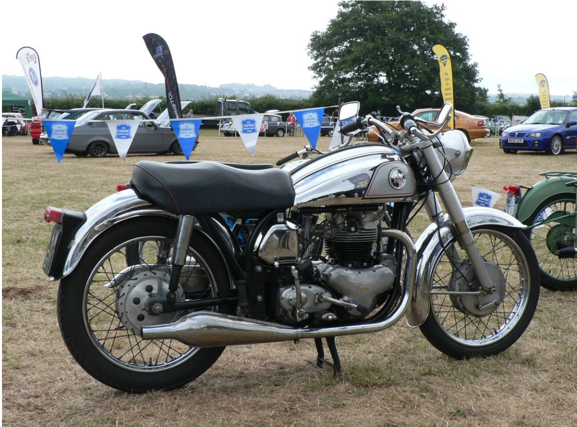
Figure 6: 1955 Norton Model 88 Dominator 500cc

The CB750A is a rare sight on these shores, only made between 1976 and 1978 for the North American and Japanese markets. These are really a semi-automatic in that 2-gears are available. Pressing the gear pedal operates one of the 2 clutch packs (1 per gear). The engine is from a CB750 but de-tuned with a 7.7:1 compression ratio.